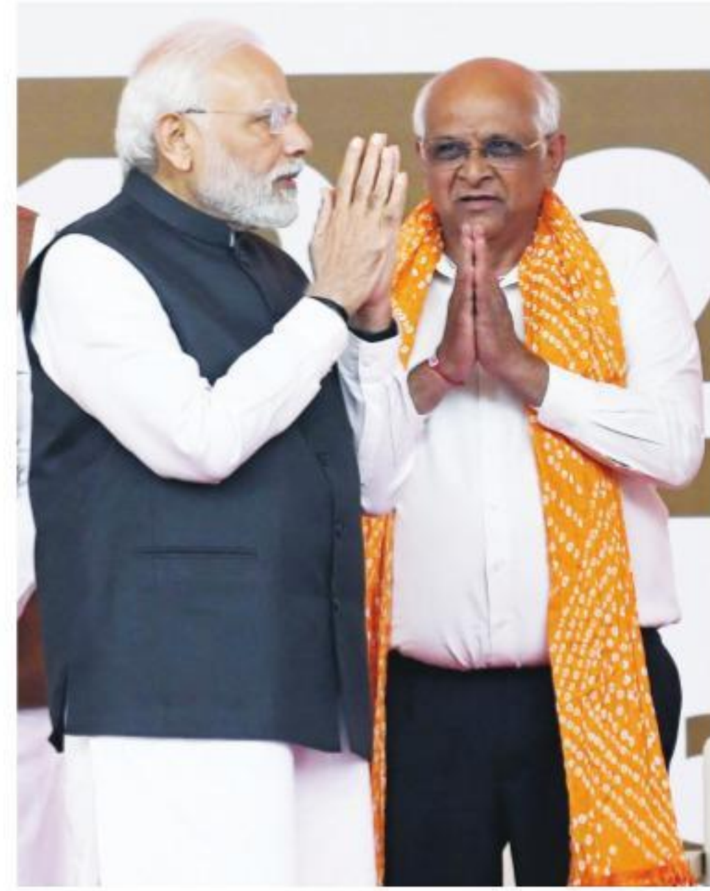
The swearing-in ceremony was held in the backdrop of rumours of at least one of the five Aam Aadmi Party (AAP) legislators planning to join the BJP "if supporters so desire". Along with Bhupendra Patel,

Bhupendra Patel, who won from the Ghatlodiya assembly seat in Ahmedabad with a record margin of 1.92 lakhs, becomes the Chief Minister for the second time